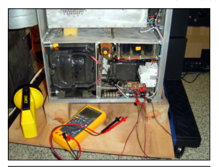
Careful Ed, even a bad plate supply can be DANGEROUS. Pull that fuse and find and check the caps before debugging