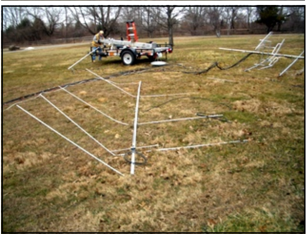
OUCH! That HURT$$$